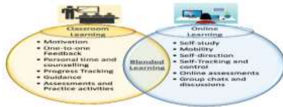
Blended Learning Online System

1. Students have more opportunities to understand and learn the learning material. 2. lecturers have more access to help students have difficulty system between synchronous and asynchronous online learning. 3. The balance between synchronous and asynchronous methods makes students more disciplined.