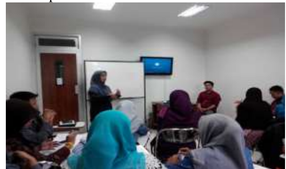
Face-to-face teaching learning before corona

The determination of COVID-19 Pandemic as a national disaster by the central Government and the policies of each campus related to the response to the COVID-19 pandemic, also affected the academic business Processes at universities in Indonesia, especially some campuses that adopted the policy of eliminating the lecture process directly on campus