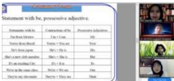
synchronous communication in material presentation

According to Uwes, learning through synchronous communication is divided into two,