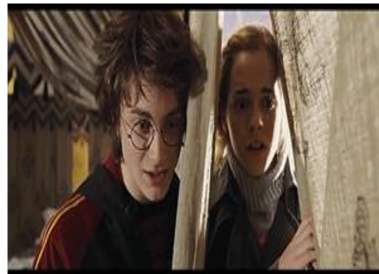
Figure 9. Hermione ask Harry's condition