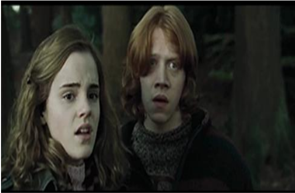
Figure 5. Harry friend's talks to him