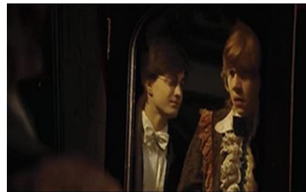
Figure 7. Preparing for the ball