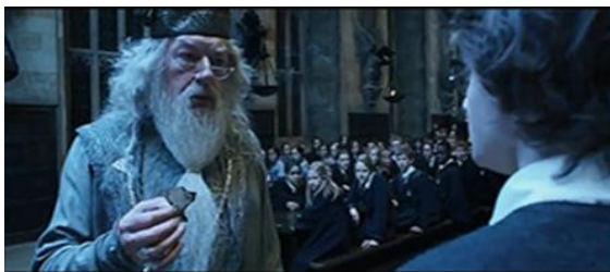
Figure 1. Joining the Triwizard tournament