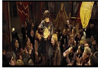
Figure 6. Winning the first challenge