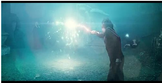
Figure 10. Duel