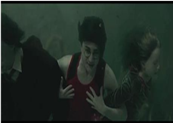
Figure 8. Dive into the lake

The social behavior of the character shows him likes to help selflessly even though the main character does not recognize the girl but he still helps her from the bottom of the lake. The main character makes his determination and shows a social behavior by helping his friends and other people he doesn't know. On the other hand, the character also ventures to dive into a deep lake which turns out to helping none other than the sister of one of the tournament champions.