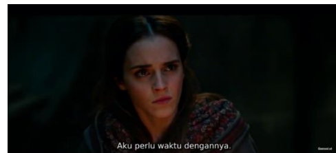
Figure 3. Belle is trying to ask Beast to let her say goodbye for the last time to her father.