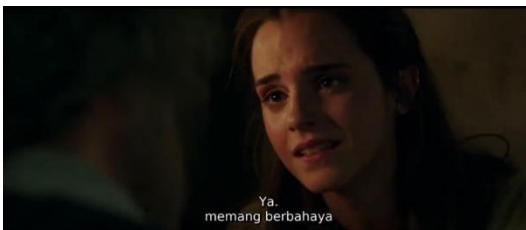
Figure 2. Belle's want to help Beast from the villagers.

The other part that show Belle brave is in the part (01.39.14 - 01.49.06) Belle, who has been freed by the beast to help her father, then meets the villagers, Belle tells the fact that there are indeed monsters in the forest but it turns out that belle's confession puts the beast's life in danger because all the villagers will come and kill the beast for fear that the village will be destroyed. However, because Belle prevented the citizens from coming to the Beast Palace, Belle was imprisoned with her father. Belle feels indebted to beast for freeing her and now Belle must protect beast, Belle asks her father for help to unlock the lock and rushes after beast without hesitation and not thinking about what will happen to her. Here's an excerpt of the dialogue :