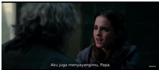
Figure 4. Belle showing her love for her father.

In this scene, Belle shows love for her father more than anything, even Belle is not afraid of the dangers out there on her way to meet her father. because her priority is her father's safety. Belle's way of showing her affection is by proving that Belle is always there for the people she cares about. Here's an excerpt of the dialogue :