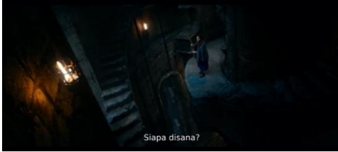
Figure 1. Belle's looked curious to know where the sound come.

After showing his face, the beast hesitated but Belle who had seen his face just stared silently without any reaction. Here's an excerpt of the dialogue :