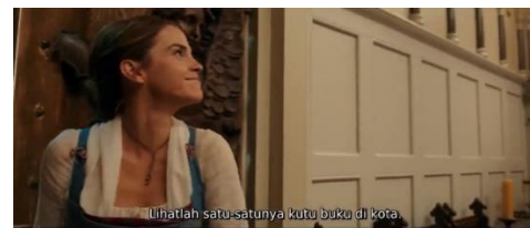
Figure 6. Belle visit library.