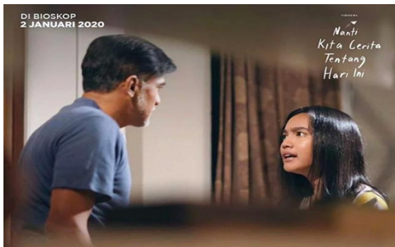
Picture 9: The scene of Awan argument with her father because Awan's attitude changed since met Kale.