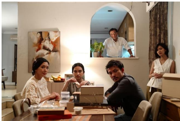
Picture 10: The scene of sadness when Angkasa tells a secret in the past that his parents have hidden, that Awan actually has a twin sister.