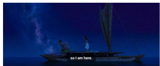
FIGURE 14 : Moana embraces collaboration and teamwork

No Action : Decide to protect her island