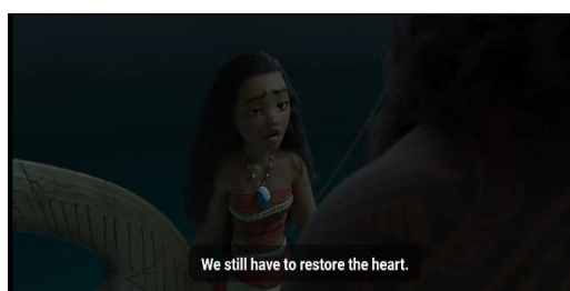
FIGURE 1 Scene of ambitious character