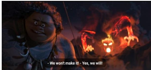
FIGURE 9 : Moana shows stubbornness