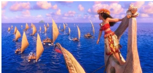
FIGURE 6 : Moana come to te fiti