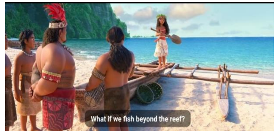
FIGURE 7 : Moana feels constrained