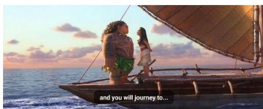
FIGURE 13 : Moana's actions showcase her empowerment and self-confidence

No Action : Moana engages in collaboration and teamwork