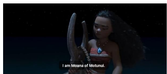
FIGURE 15 : Moana's mission to