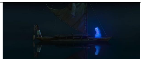
FIGURE 8 : Moana faces moments