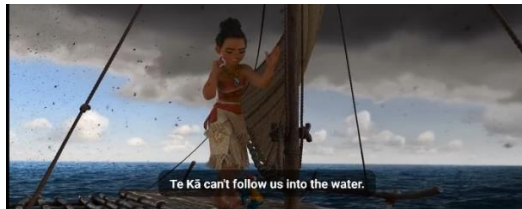
FIGURE 2 Moana and the aunt sailing