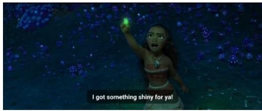
FIGURE 12 : Moana challenges traditional gender roles

No Action : Demonstrate her empowerment and self-confidence