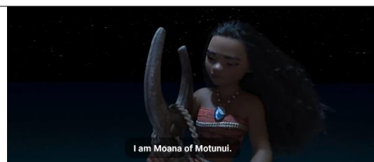
FIGURE 5 Moana come to Te Fiti