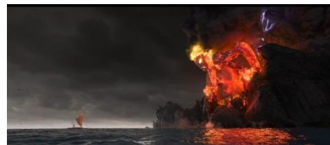
FIGURE 4 Moana sails alone to Te Fiti