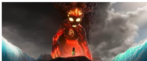
FIGURE 3 Moana Spoke to the ocean