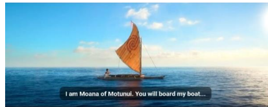
FIGURE 11 : Moana's Journey is driven by her desire

No Action : Challenges traditional gender roles